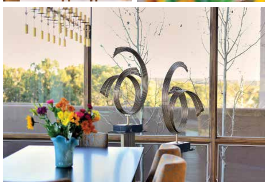
Clockwise from top left: A bronze sculpture by David Pearson adds character to the master bedroom. | A Tommy Mitchell fourpanel metal flower hangs above the living room's fireplace. | The dining area showcases two metal swirl sculptures on pedestals and a glass and bronze chandelier over an 8-foot table.

and windows, including floor-to-ceiling windows in the master bathroom. Automated shades and three gas fireplaces, including a see-through, 6-foot-long fireplace in the living room, make up the modern amenities. But the biggest selling point might be the sliding pocket doors that disappear into the walls.