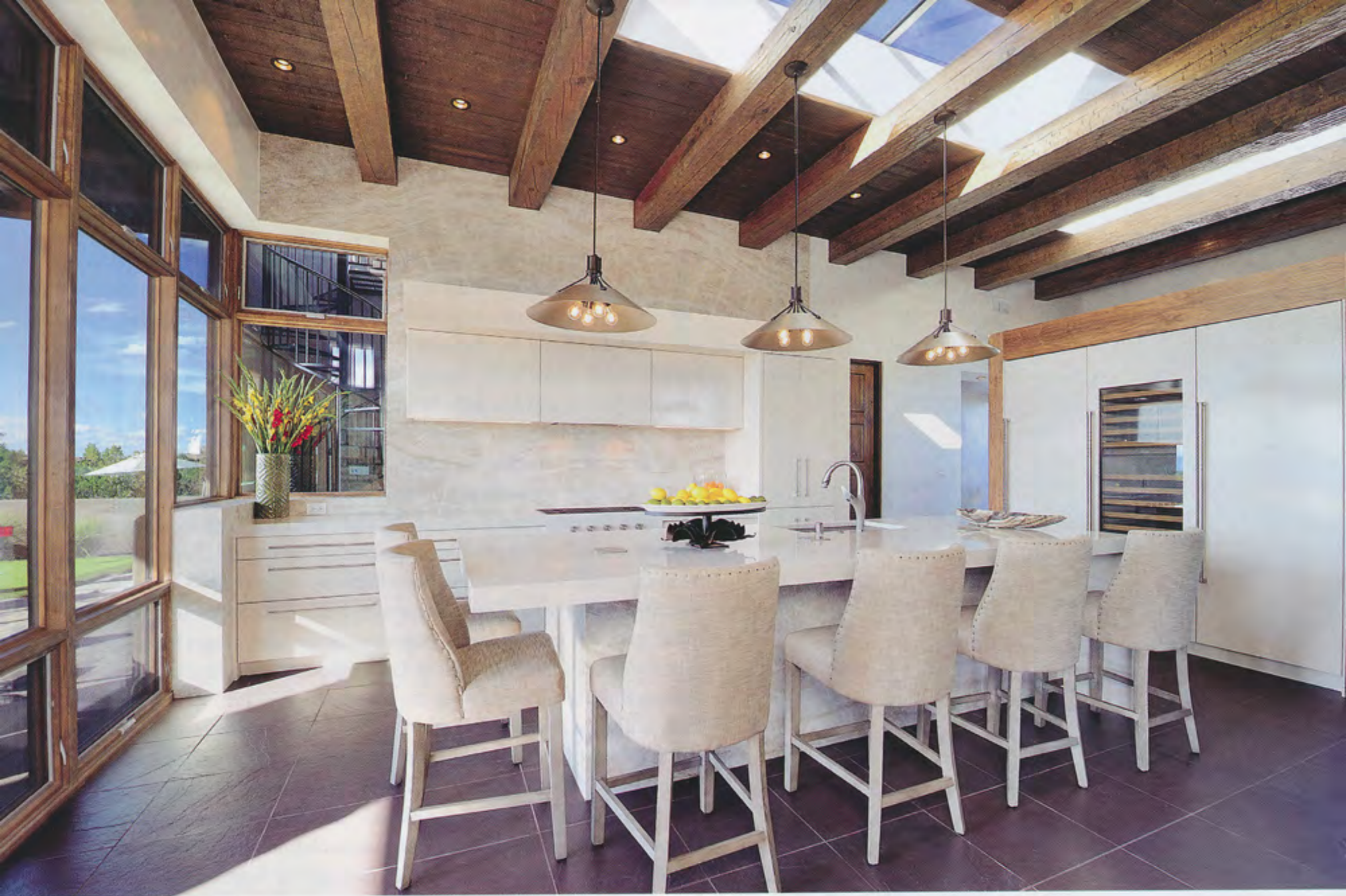
Above: Bookmatched stone repeats below the island, behind the range and above the cabinetry, creating a deep visual plane. Light-colored surfaces awash with natural light make the whole room glow.