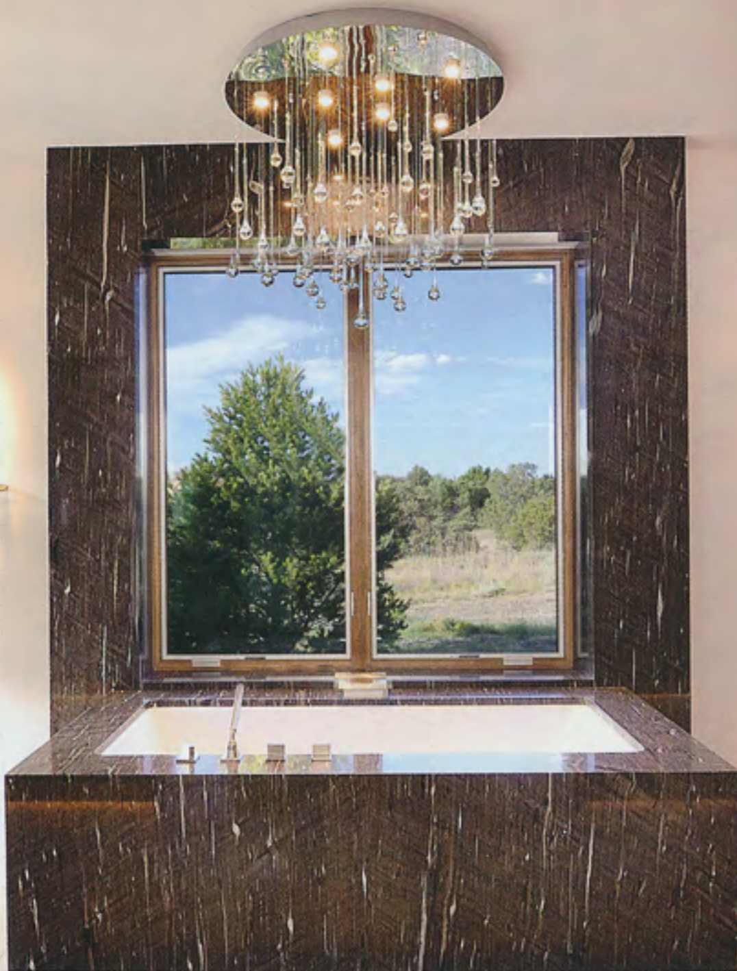
Above: Perhaps the most luxurious spot in the house is the master bath, decked out in a richly patterned marble and topped with a chandelier that itself resembles water droplets falling.

Outside there is much to enjoy, from a rooftop deck to a hot tub to a putting green. The landscape is as artistically executed as the interior, with architectural planters, concrete spheres and a water feature. “They paid a lot of attention to the exterior spaces. They paid as much attention to the outside as to the inside,” says O’Carroll. Radiant heaters on the portal extend the season. With so many floor-to-ceiling windows, whether standing indoors