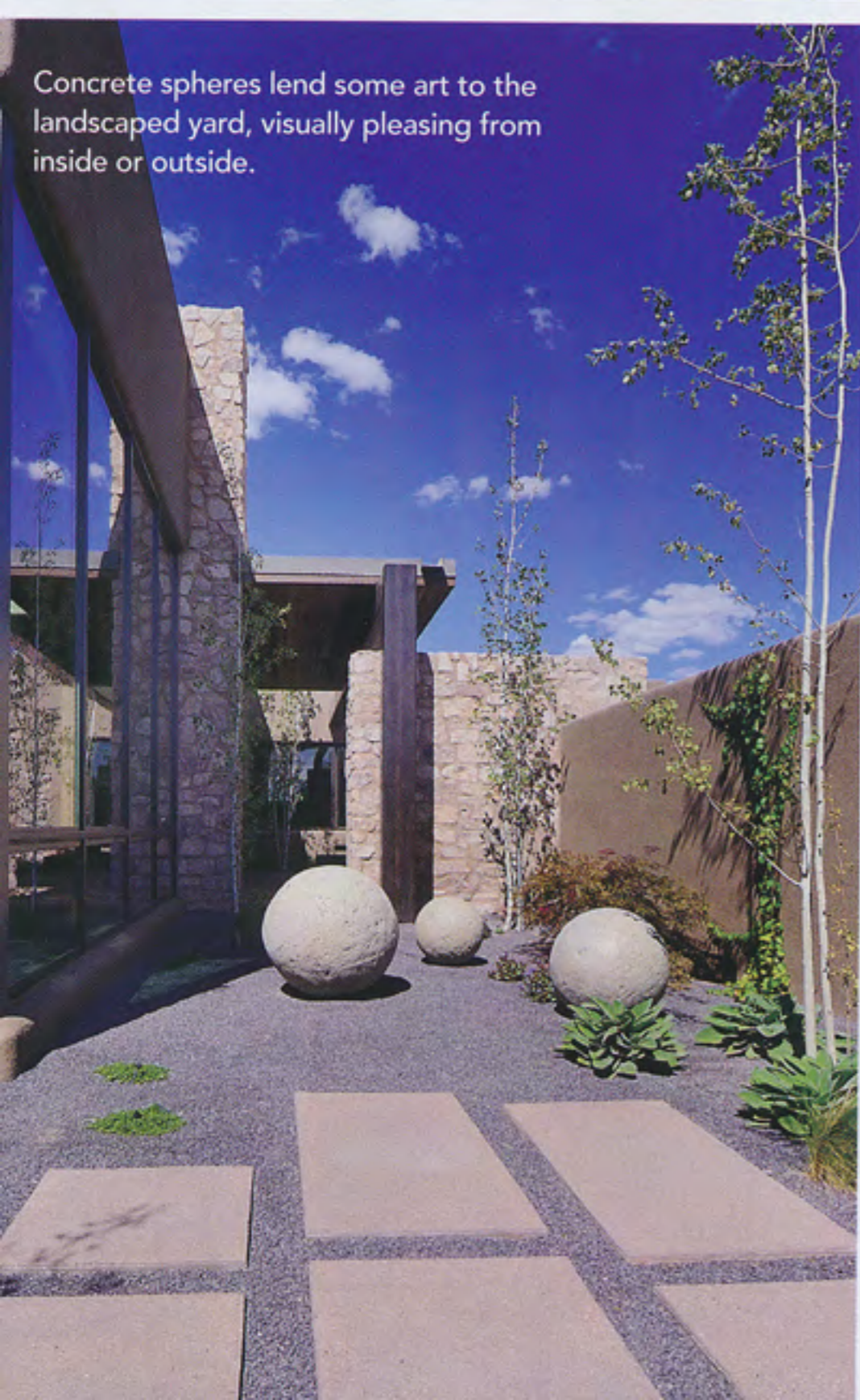
Concrete spheres lend some art to the landscaped yard, visually pleasing from inside or outside.

A private, walled outdoor space allows for sunbathing or a dip in the hot tub under a starry New Mexico sky.