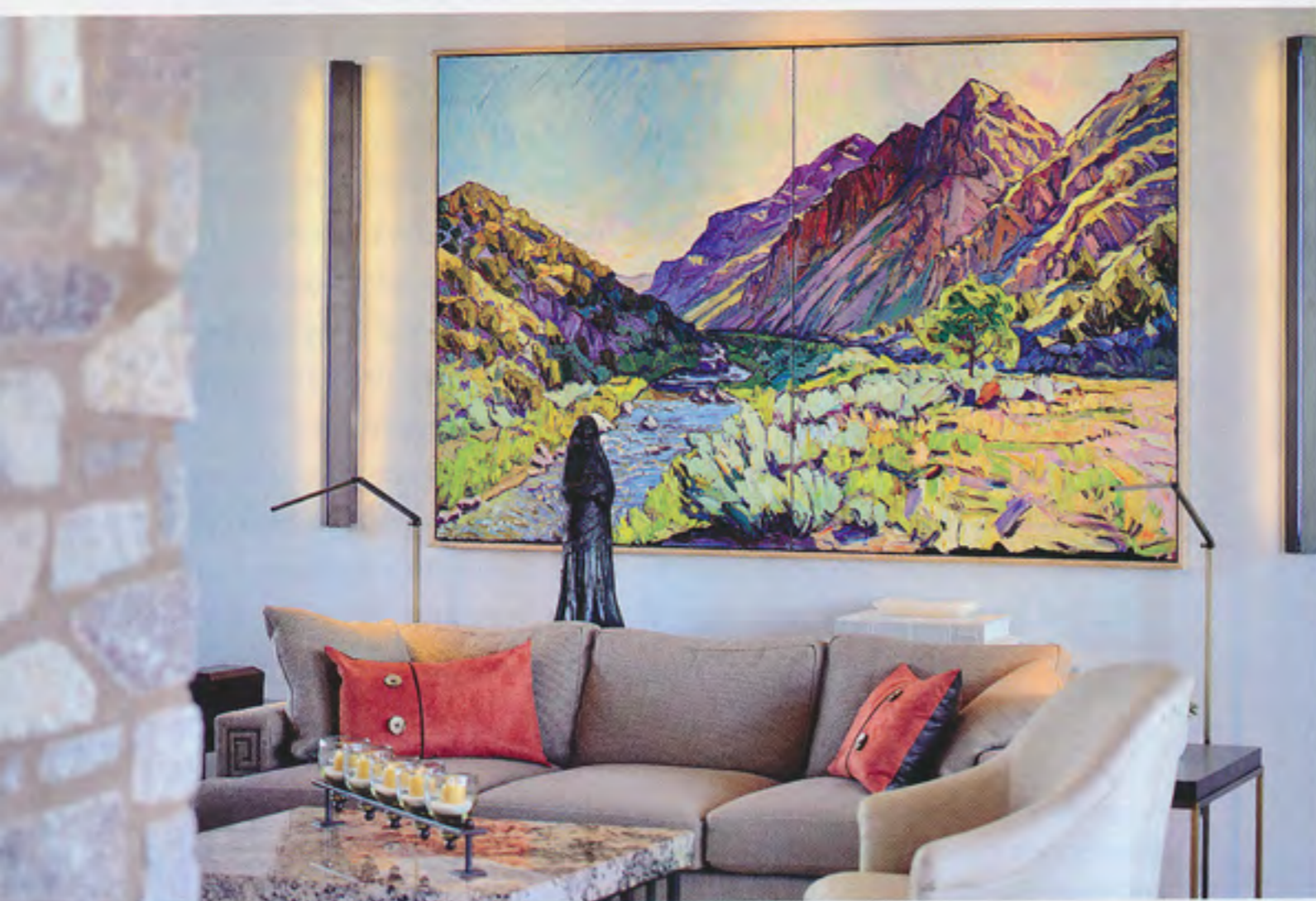
Above: Tall, decorative sconces bracket a painting. The neutral tones of the home allow colorful artwork to stand out.