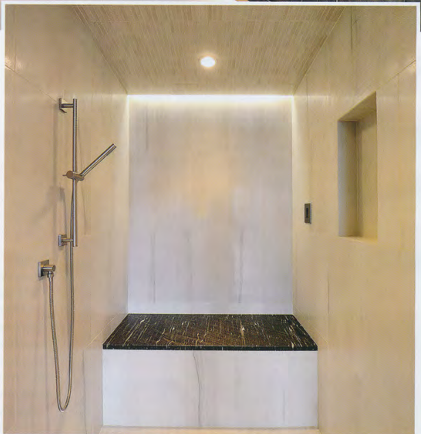
A slab of dark marble anchors an otherwise light and bright master shower.

So, what would one call the style of this mixed-media home? The artists who created it have a lot to say about that. “In this case we have exposed beams, as you would expect on a Pueblo Revival, and plaster interior,” says